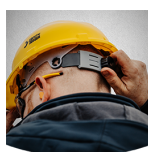
Easy to adjust

Easy tighten or loosen the helmet's fit thanks to the wheel ratchet at the back.